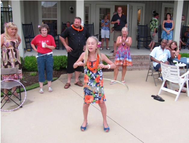
Fun times at the Hawaiian Luau Hoola Hooping!

HP Community Management Company Community Solutions Southeast, LLC 2108 Capital Drive, Unit 102 Wilmington, NC 28405 910.799.9779 www.communitysolutionse.com "Solution"